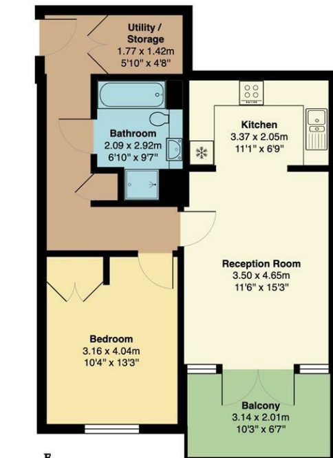
First Floor Total Area: 55.9 m 2 ... 602 ft 2 (excluding balcony) All measurements are approximate and for display purposes only

Utility / Storage 5'9" x 4'7" Bathroom 6'10" x 9'6" Kitchen 11'0" x 6'8" Reception Room 11'5" x 15'3" Balcony 10'3" x 6'7"