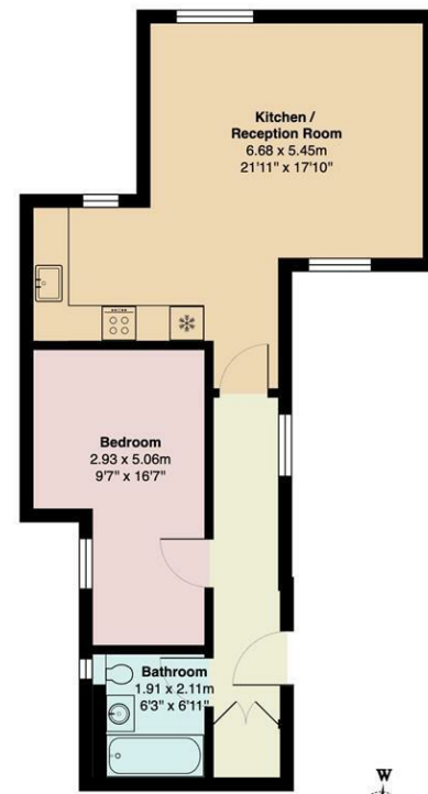
First Floor Total Area: 53.3 m 2 ... 574 ft 2 All measurements are approximate and for display purposes only