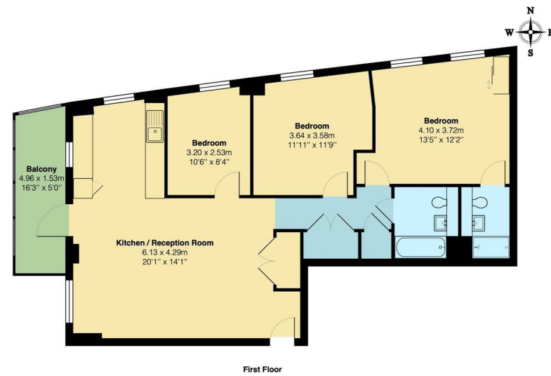
Total Area: 89.7 m 2 ... 966 ft 2 (excluding balcony) All measurements are approximate and for display purposes only.