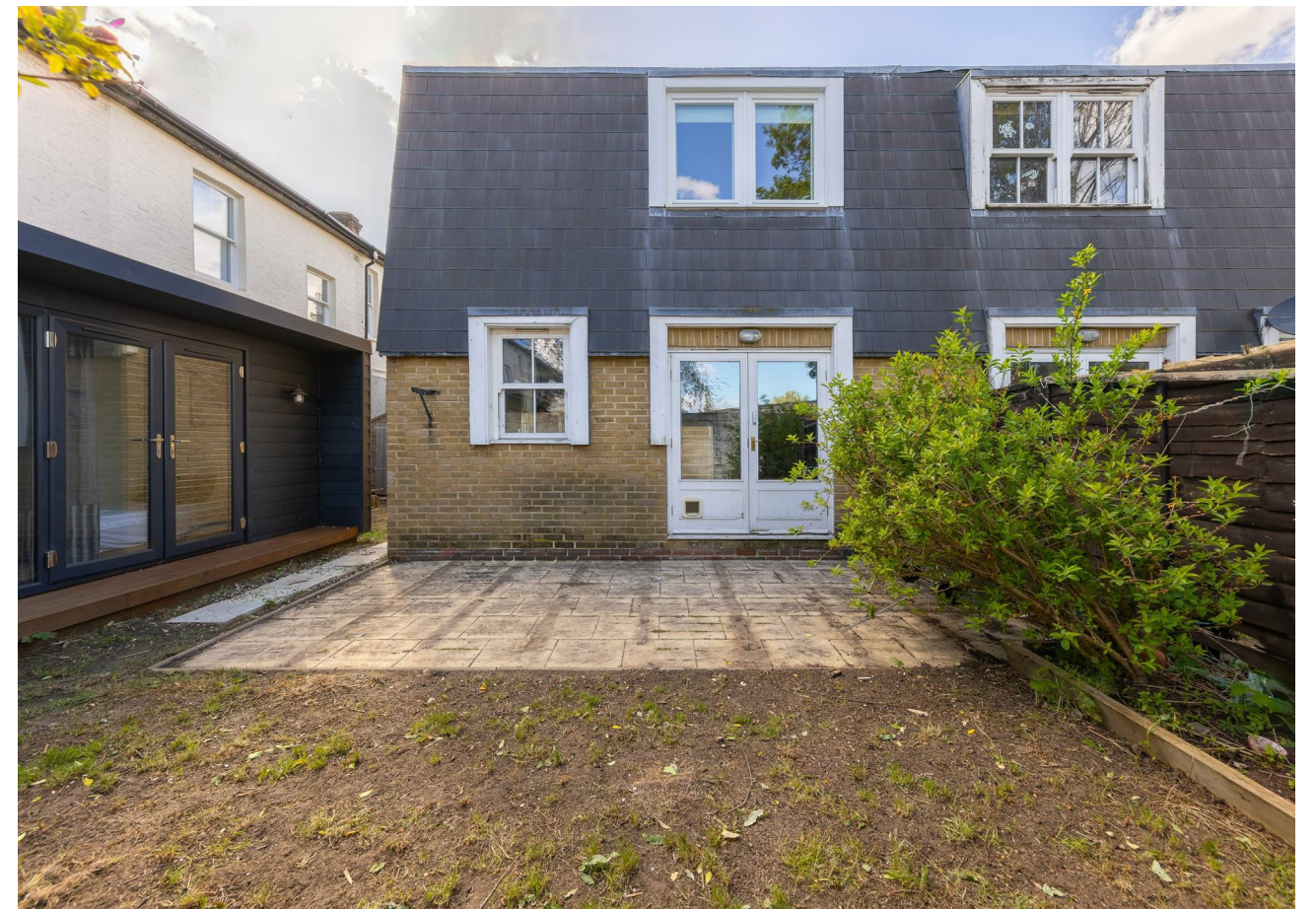
Garden Studio 6'7" x 13'2"