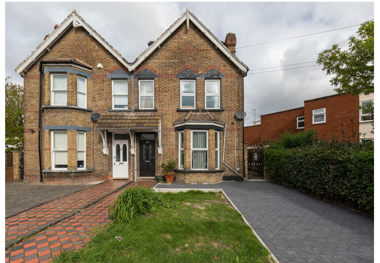
Garden approx 19'6'10"