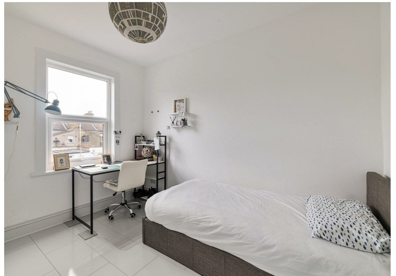
FOLLOW US → @STOWBROTHERS STOWBROTHERS.COM