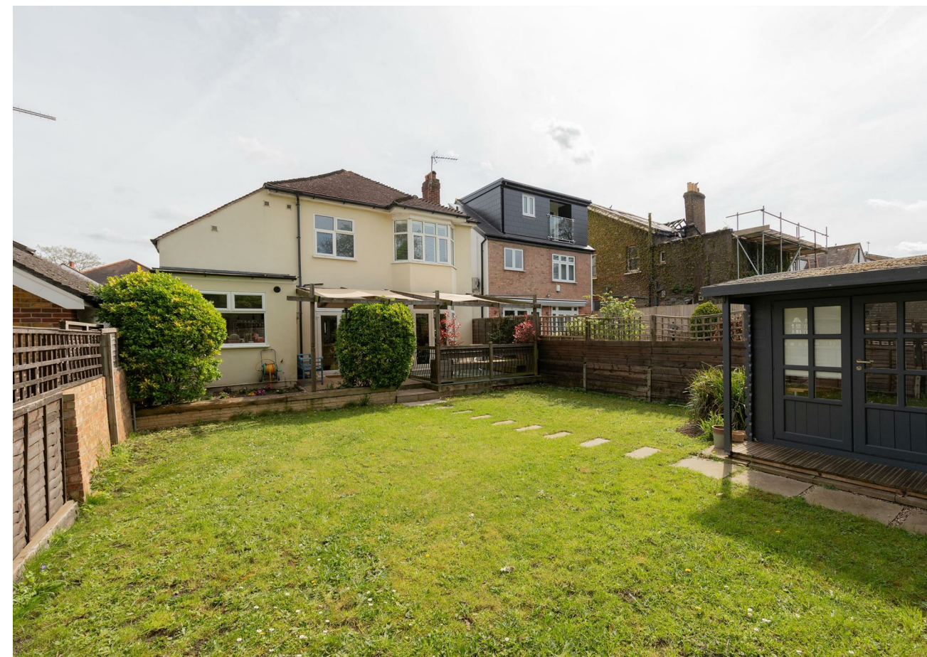
Garage 13'4" x 7'10"