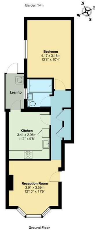
Total Area: 48.9 m 2 ... 526 ft 2 (excluding lean to) All measurements are approximate and for display purposes only.