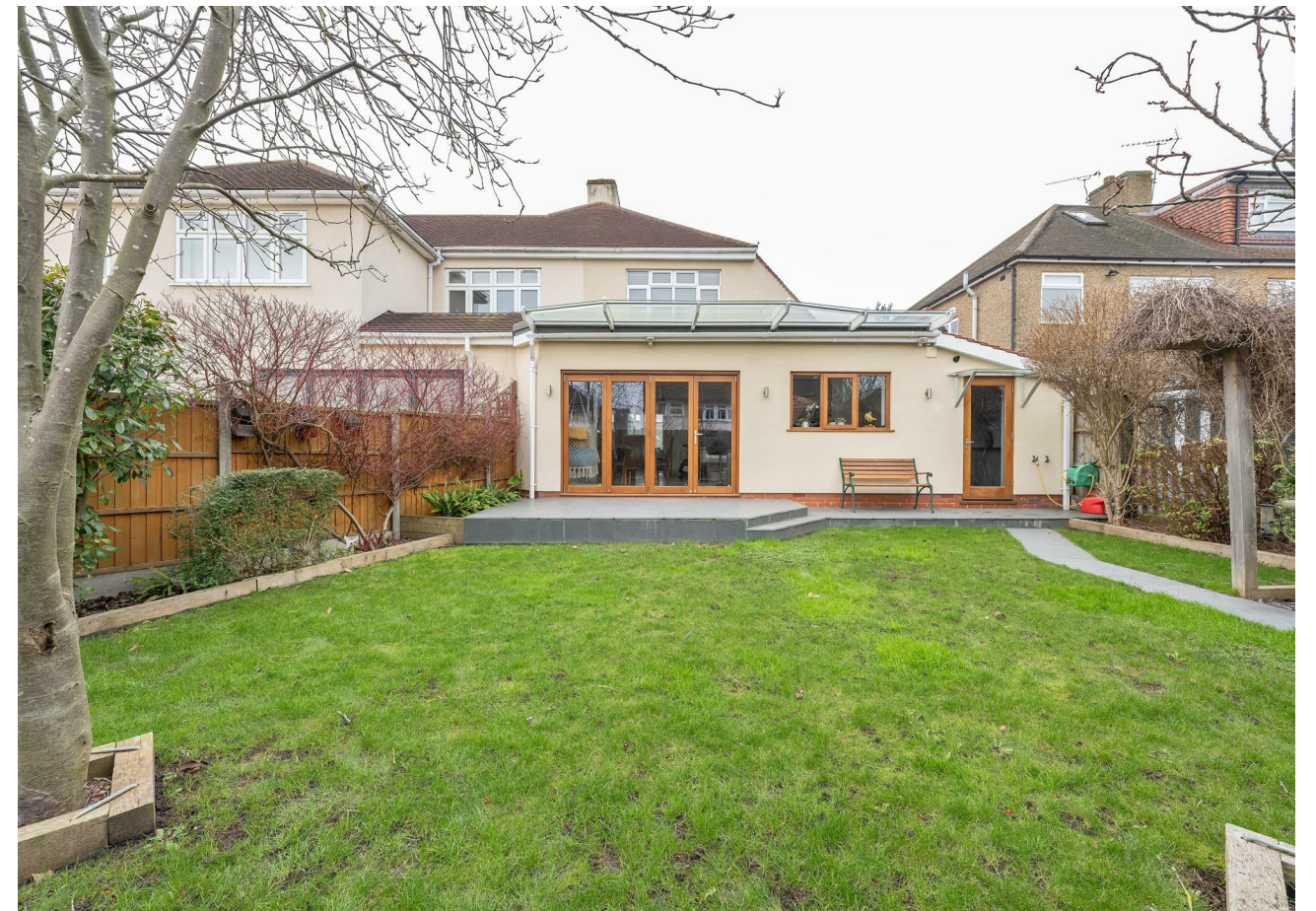
Garden approx. 41'11" x 35'1"