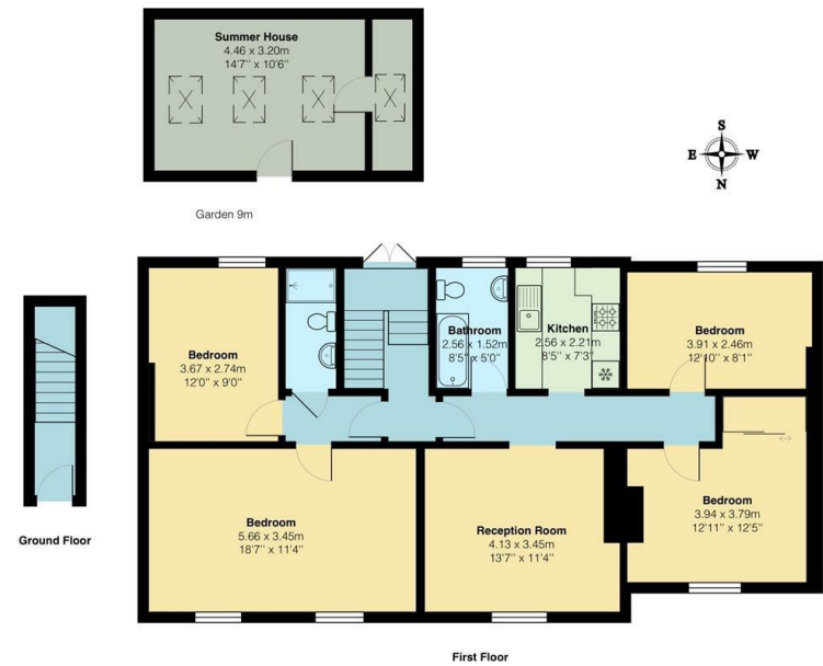
Total Area: 102.3 m 2 ... 1101 ft 2 (excluding outhouse) All measurements are approximate and for display purposes only.