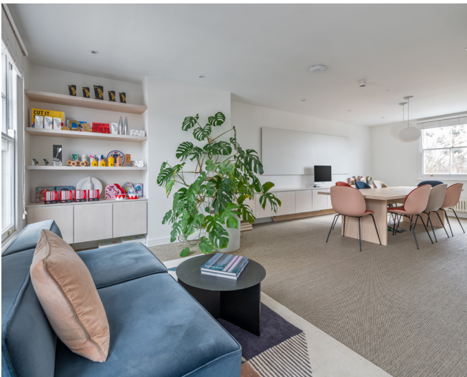
↑ top floor

The property is in immaculate condition throughout, with primarily white décor that maximises the space and light, and high quality fixtures and fittings including: