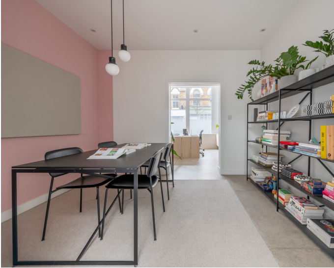
↑ ground floor second room