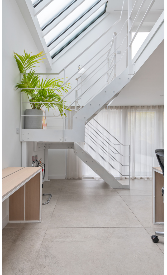
↑ ground floor rear room