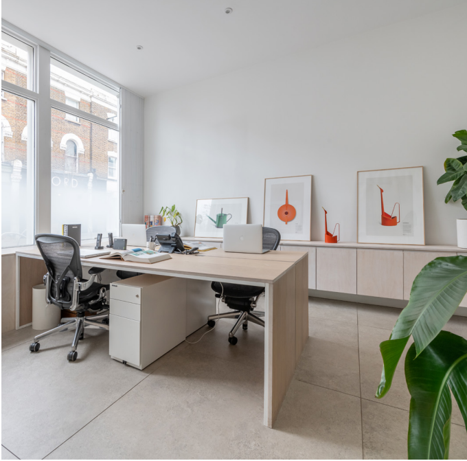
↑ ground floor shop front