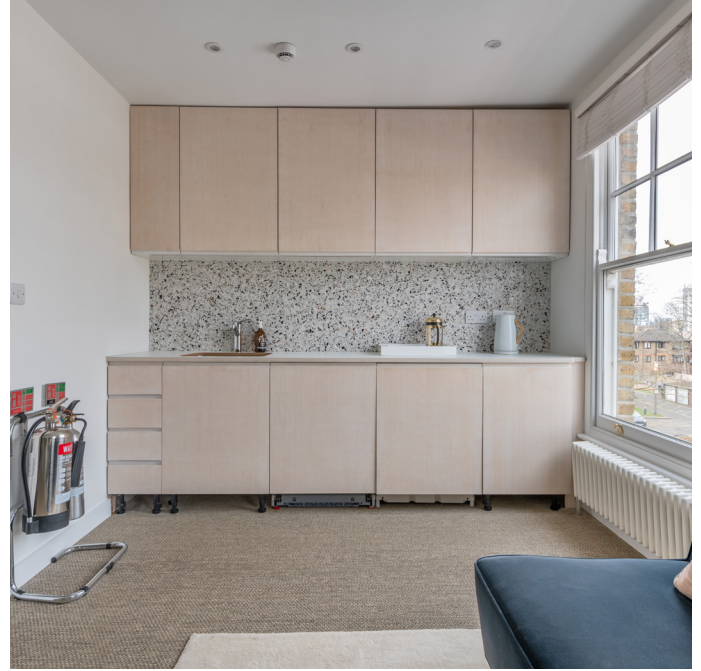
↑ top floor