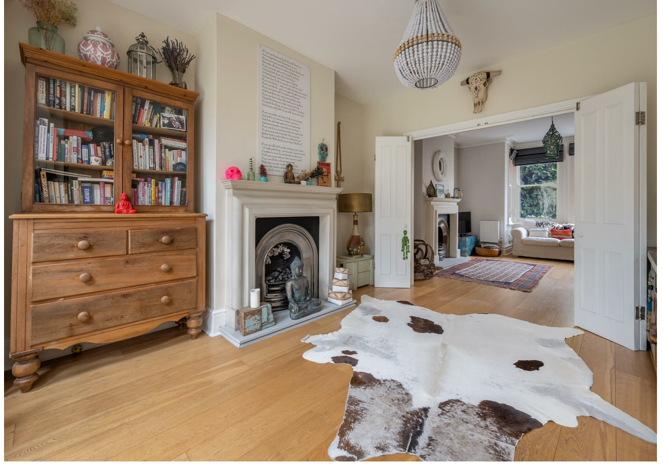
FOLLOW US → @STOWBROTHERS STOWBROTHERS.COM