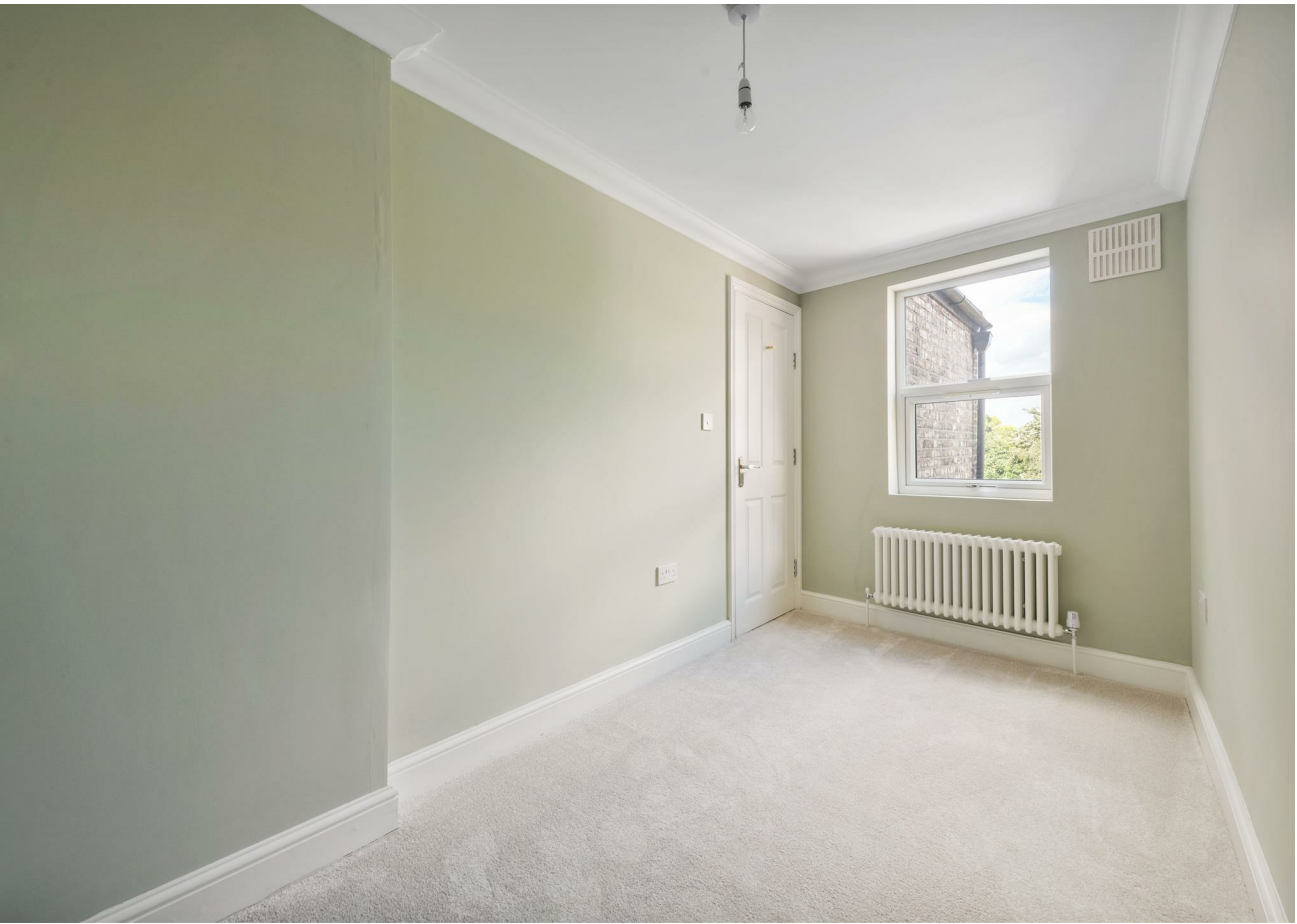
Bedroom 11'9" x 18'4"