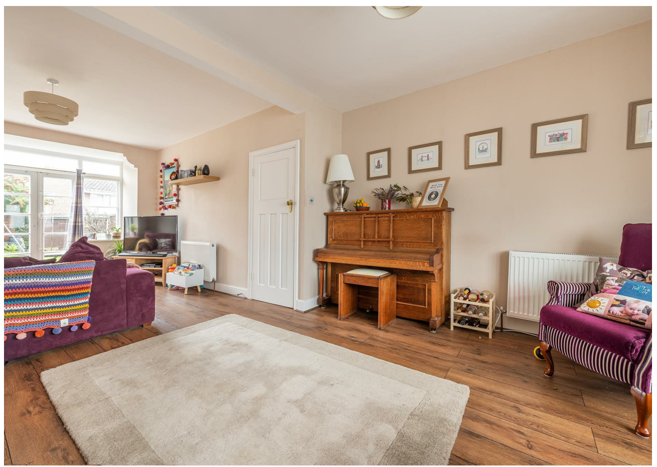
FOLLOW US → @STOWBROTHERS STOWBROTHERS.COM